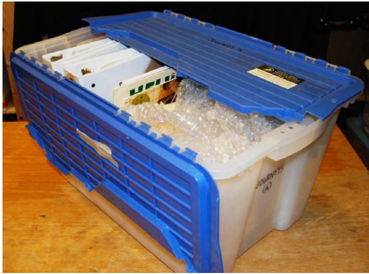
Journeys Kit from the outside.