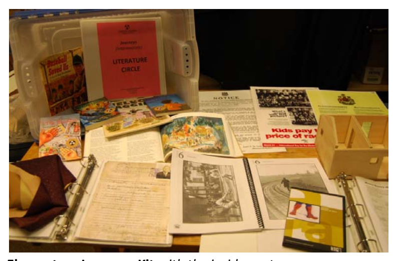
Elementary Journeys Kit with the insides out.

The Elementary Kits are designed to support the Grade 5 BC Social Studies Curriculum. Here's what they include.