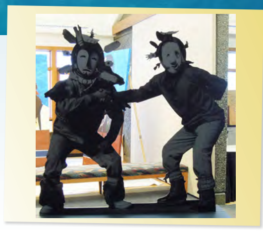
Exhibition at Alaska Native Heritage Centre, Anchorage, Alaska.

Welcome to the third issue of The History Education Network / Histoire et éducation en réseau's (THEN/HiER) Annual Review which highlights major activities, initiatives and other news over the past year.